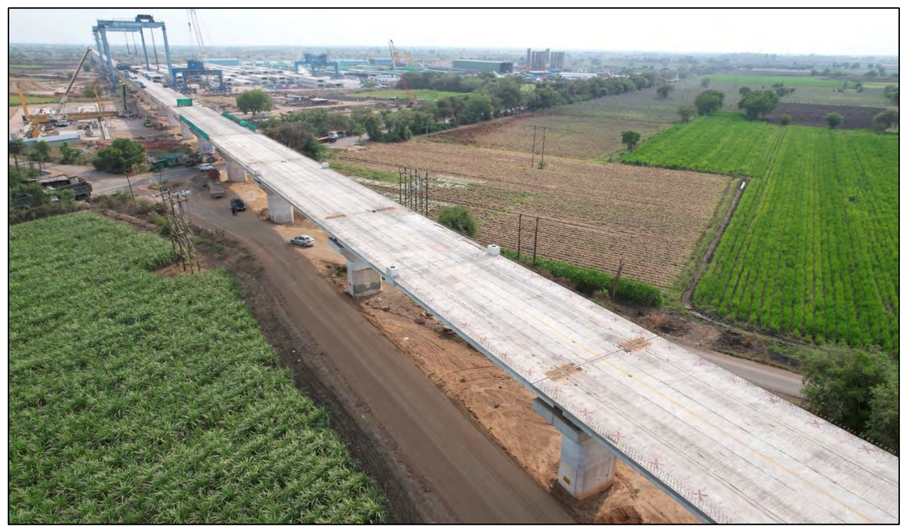
Completed viaduct portion, Vadodara, Gujarat