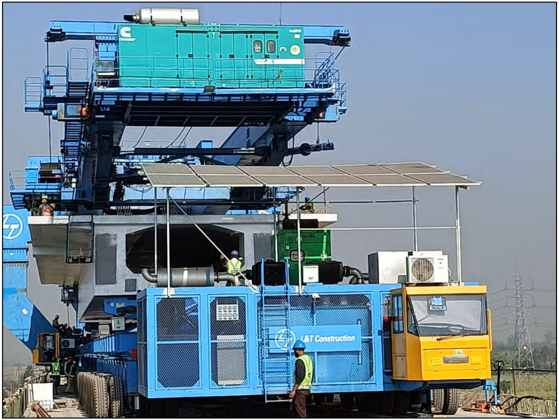
Solar Panel Provided on Girder Transporter To Power A/C of Operators Cabin

As per Power Purchase Agreement for developing 700kWp (RESCO Model) (signed with OPPL DEL SPV Pvt Ltd.), the work for setting up of solar panels at rooftop of Sabarmati passenger hub terminal building is under process. The said work would promote green energy in HSR, and would result in saving of energy cost.