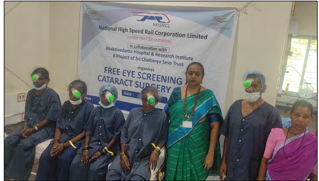
Beneficiaries post-cataract surgery, Thane, Maharashtra