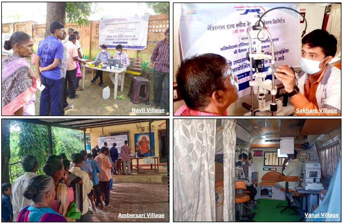
Identification camps for cataract surgery, Palghar, Maharashtra

e) The total CSR obligation for the financial year amounts to Rs.1,34,27,715/- [i.e. (b) + (c) - (d)]