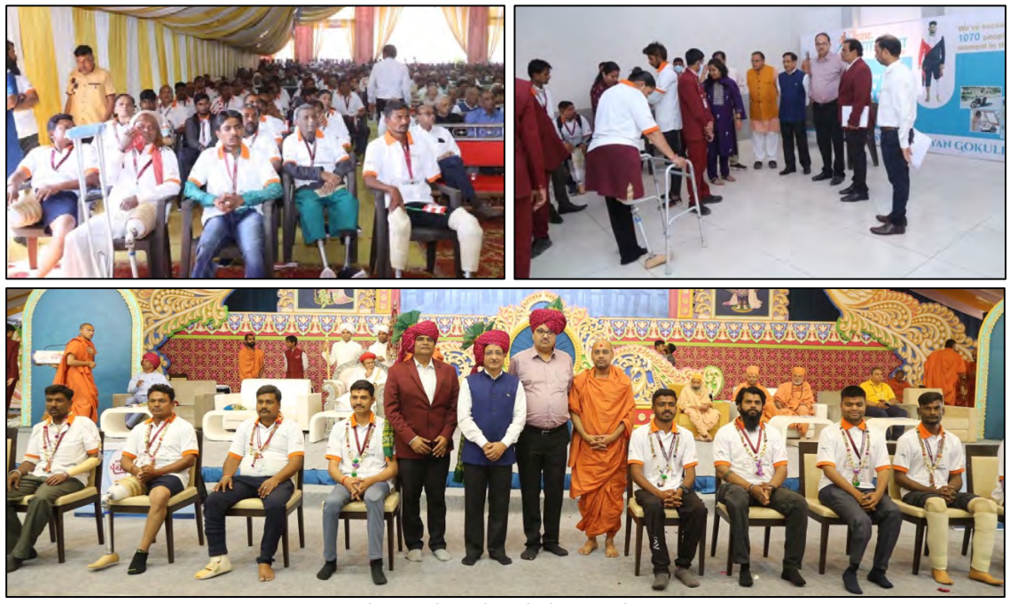
Distribution of prosthetic limbs, Anand, Gujarat

Both, the Nodal Officer and Company Secretary attended all the above said three CSR Committee meetings of the Company held during 2022-23.