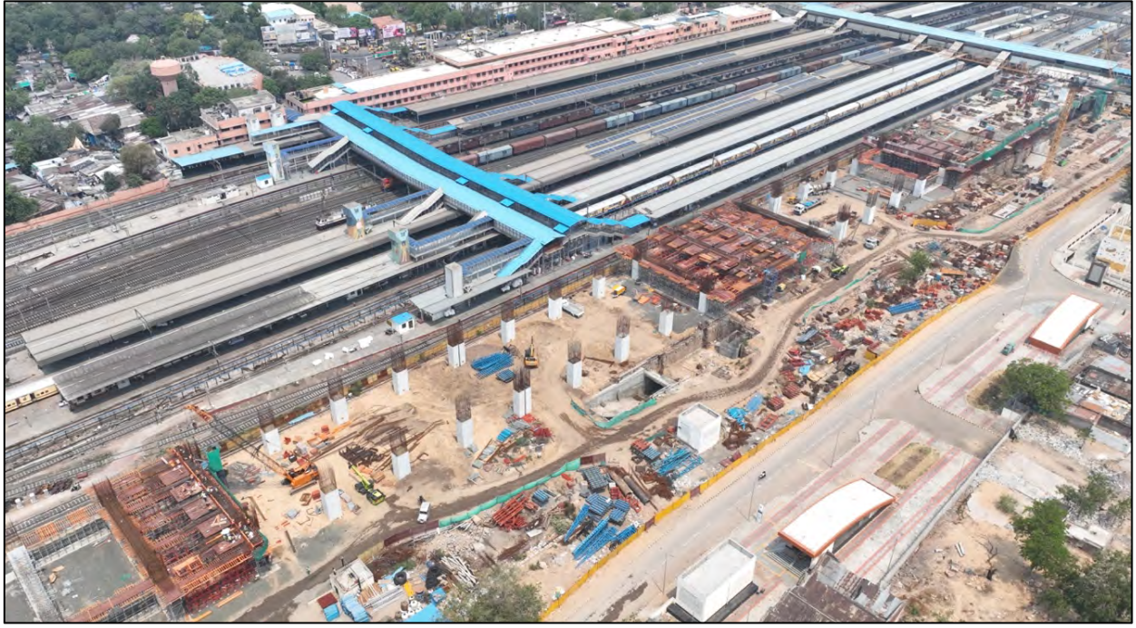
Work in progress at Ahmedabad HSR station, Gujarat

The Annual Report of the Company is available at following link - <u>https://www.nhsrcl.in/en/ about-us/annual-report</u>.