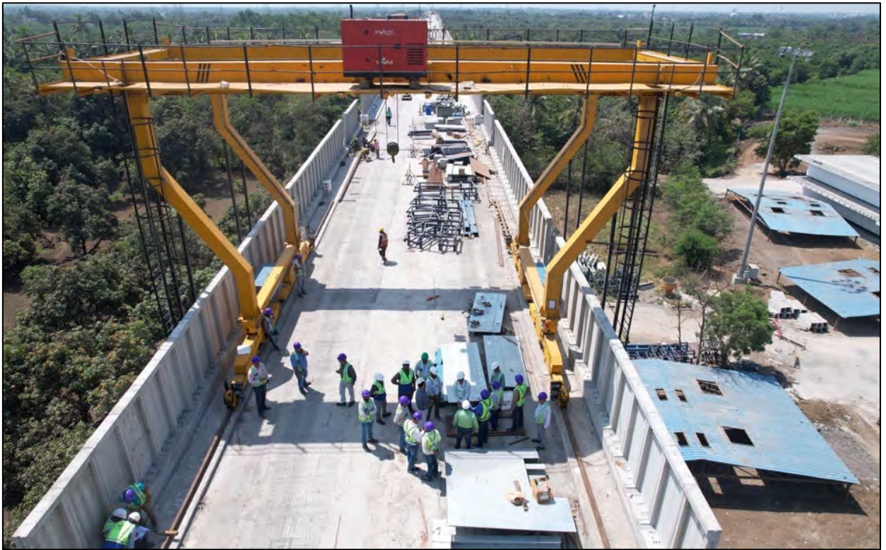
Noise Barrier Erection Work in Progress, Navsari, Gujarat

Your Company is also in the process of registering various variations of its already registered <u>trademarks</u> i.e. logo along with acronym of its name, under the Trade Marks Act, 1999.