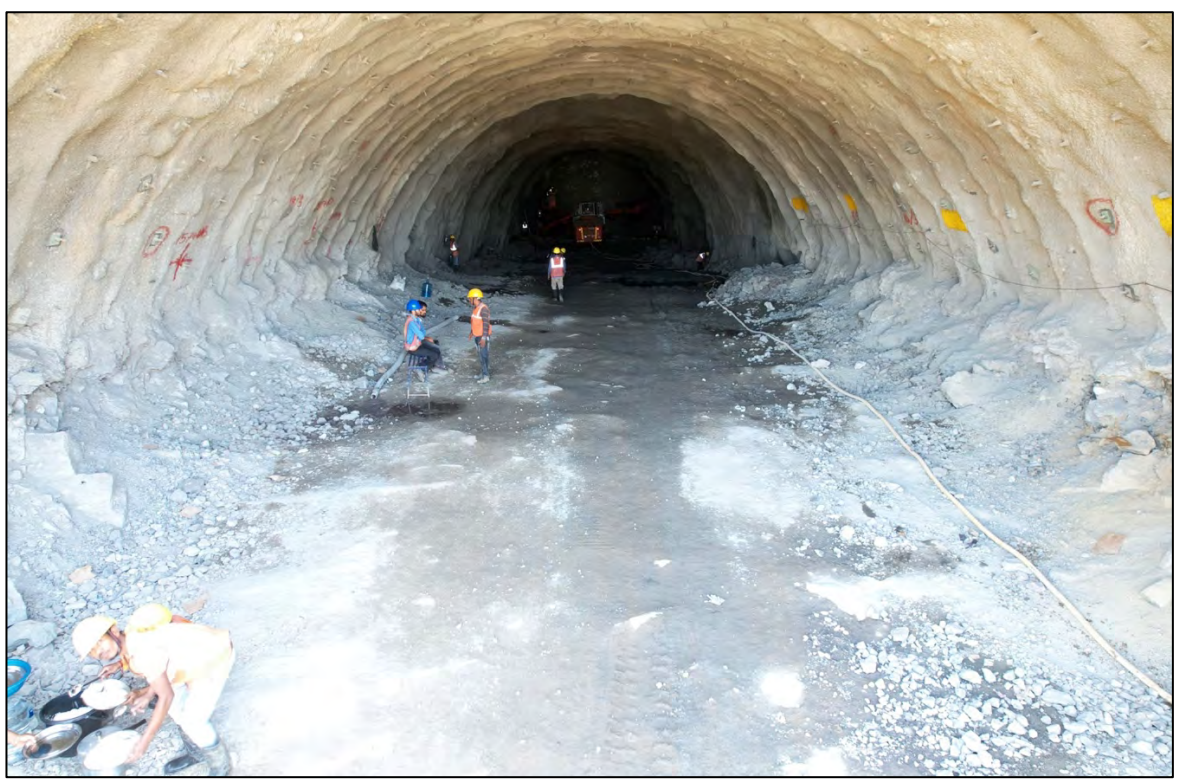
Tunnel excavation in progress at Vapi, Gujarat

Awarded seven JICA contract packages viz. C1; T3; TI4 (Simulator); R1-PS (for preliminary survey regarding Rolling Stock and General Inspection Train); D2 (for construction of the Sabarmati Depot); PMC-Advisory Services; and PMC-TRS.