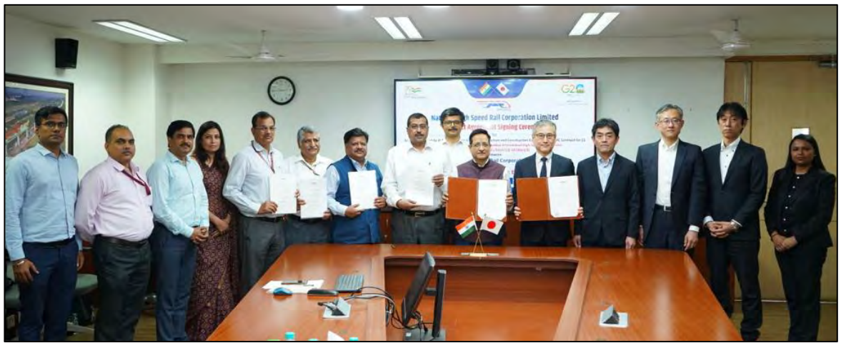
Signing of Delegation Agreement with Japan High Speed Rail Electric Engineering Co. Ltd. (JE)