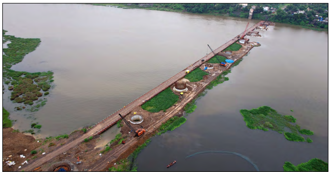
Well Foundation Work in progress at Tapi River, Surat, Gujarat