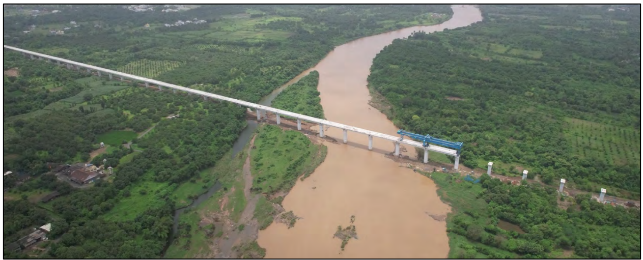
Launching completed at Auranga River, Valsad, Gujarat

Fabrication of steel <u>bridges</u>, pre-stressed concrete bridges, river bridges are also continuing. Your Company has completed five river bridges on Par, Purna, Mindhola, Ambika, and Auranga Rivers till date.