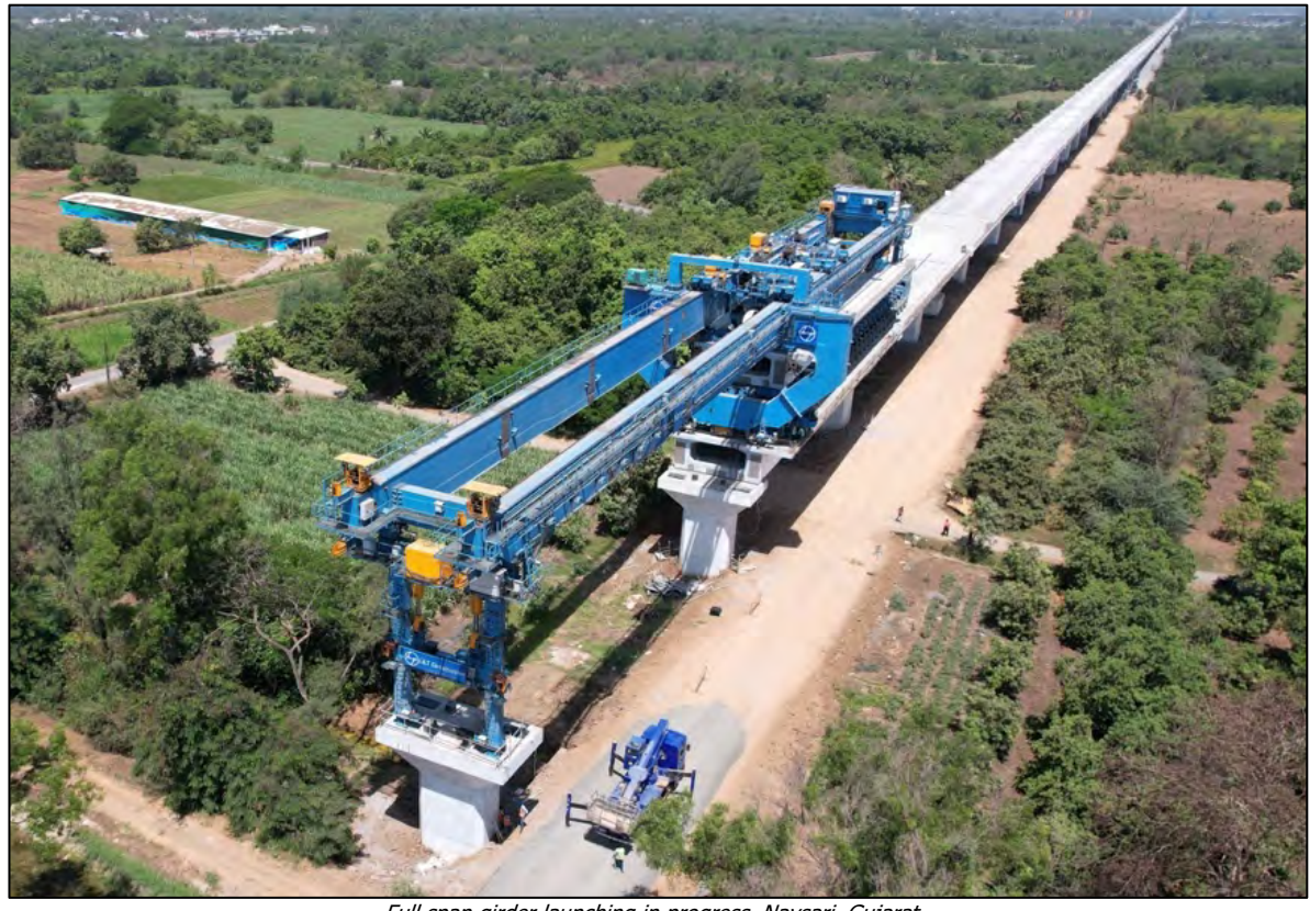
Full span girder launching in progress, Navsari, Gujarat

i) Permission granted in April 2022 by National Monument Authority (NMA) under Ancient Monuments and Archaeological Sites and Remains Acts, 1958, for construction of MAHSR project within the regulated area of the two protected monuments [i.e. Sidi Basirs' Minar and Tombs (Shaking) and Brick Minar at Kalupur, Ahmedabad].