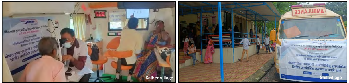
Camps for identification of cataract surgery, Thane, Maharashtra

The Company has laid down a system for selection of CSR activities, whereby field level offices may recommend CSR proposal based on local needs after interacting with stakeholders.