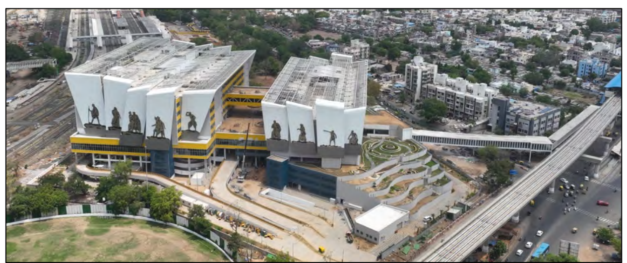
Finishing work in progress at Sabarmati Passenger Terminal Hub, Gujarat