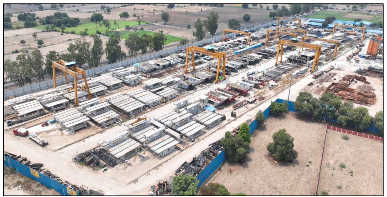
Segmental Casting yard, Ahmedabad, Gujarat