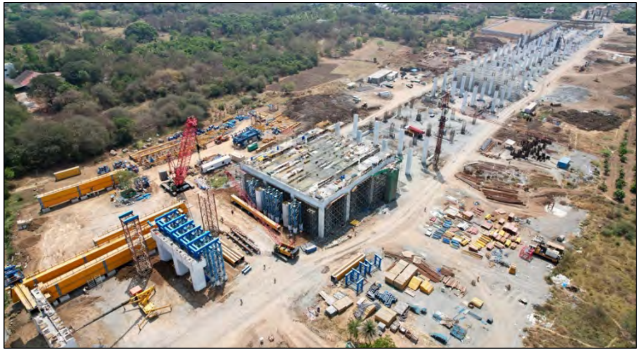
Work in progress at Billimora HSR station, Gujarat