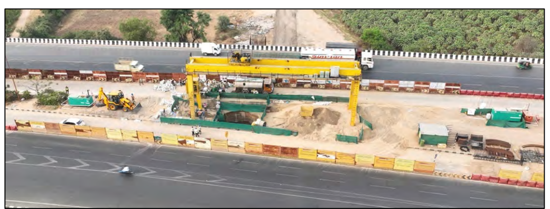
Shinso Pile Work in Progress at Vadodara, Gujarat