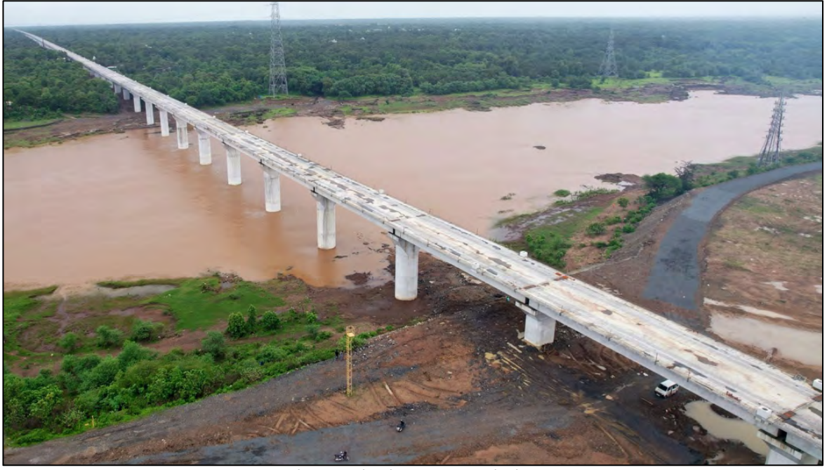
Launching completed at Par River, Valsad, Gujarat