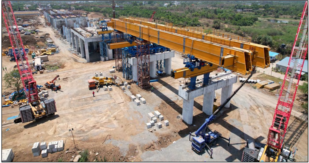
HSR Bilimora Station Approach viaduct launching in progress, Gujarat