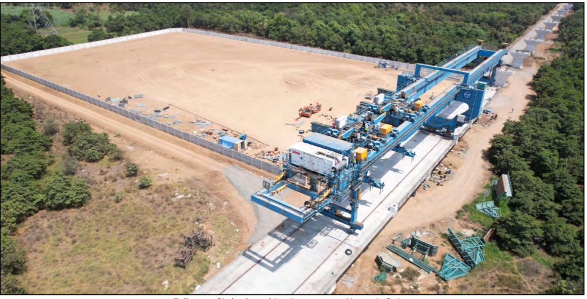
Full span Girder launching in progress, Navsari, Gujarat